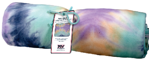
PASTEL STRIPE TIE-DYE